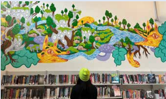
Photo: The Kilton Library in West Lebanon, New Hampshire