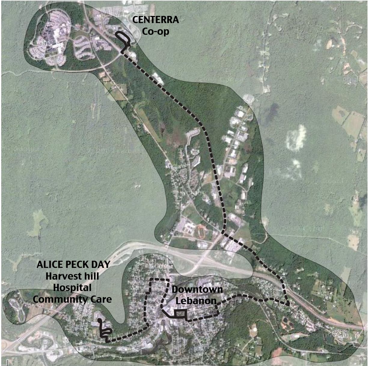
Figure 4.2 Map of Proposed APD / Centerra Flex Route